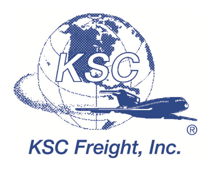
The 2018 Exclusive Sponsorship has been sold! Thank you to KSC Freight

Monthly membership luncheons feature people and issues important to the Kent business community with excellent learning and business to business networking opportunities.